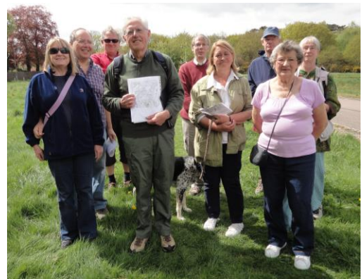
Groups on Roebuck Green at the start of the Walk