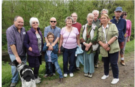
Boundary Walkers near the River Roding on the way to the 'Hungry Horse' for refreshments