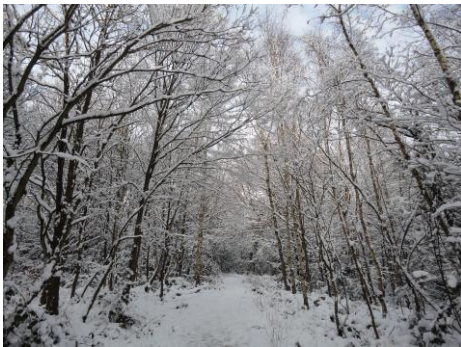
Epping Forest (Powell's Forest in Buckhurst Hill)

The Conservators of Epping Forest have recently completed the largest public consultation they have ever undertaken.