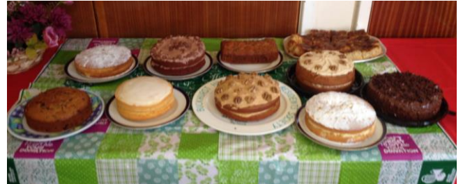
Some of the cakes provided by members

In September BHRS held its annual coffee morning in aid of Macmillan Cancer Care as part of the 'Biggest Coffee Morning'. Members were very generous in providing a splendid selection of home-made cakes and a record number of people attended the Coffee Morning, which raised £315.